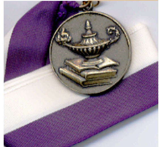
Northeast Missouri Phi Beta Kappa Association Awards Medal